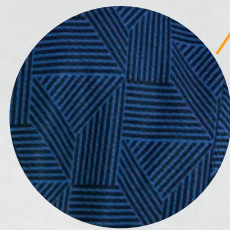
> Navy print contrast fabric